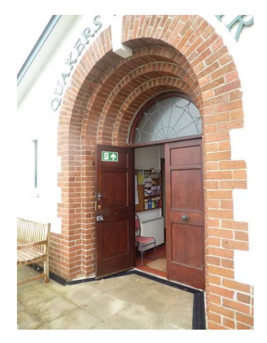
Fig.3: main entrance

The interior retains some 1950s details such as the oak parquet floor in the main hall, a stage at the far end of the hall with an oak boarded floor, quarry tiled floors in the cloakrooms and flush doors. The main hall has a 3-bay roof with exposed concrete portal trusses; the roof has recently been insulated and the sloping soffit is now lined with tongued and grooved pine boarding. Walls are plain plastered. At the south-west end of the building behind the stage, and reached by a short staircase, is a smaller meeting room and a kitchen.